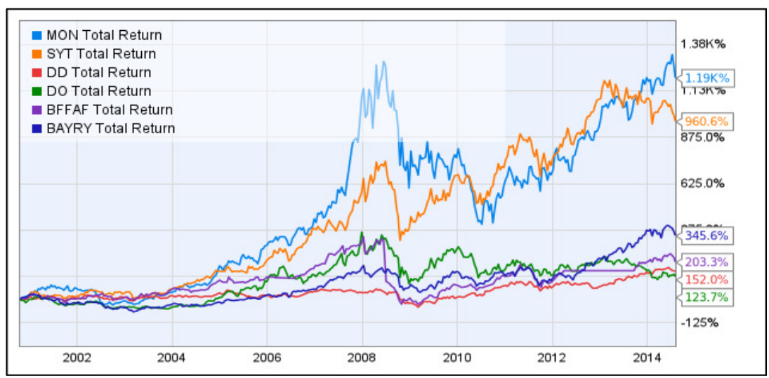
Fig. 2: Return value of the largest agricultural packages corporations [19]

MON (Monsanto), SYT (Syngenta), DD (Du pont), DO (Dow chemical), BFFAF (Basf), BAYRY (Bayer)